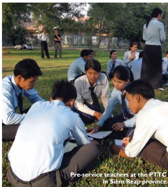
Pre-service teachers at the PTTC in Siem Reap province

"The training manual has provided us with some good methodologies and strategies for teaching," he says.